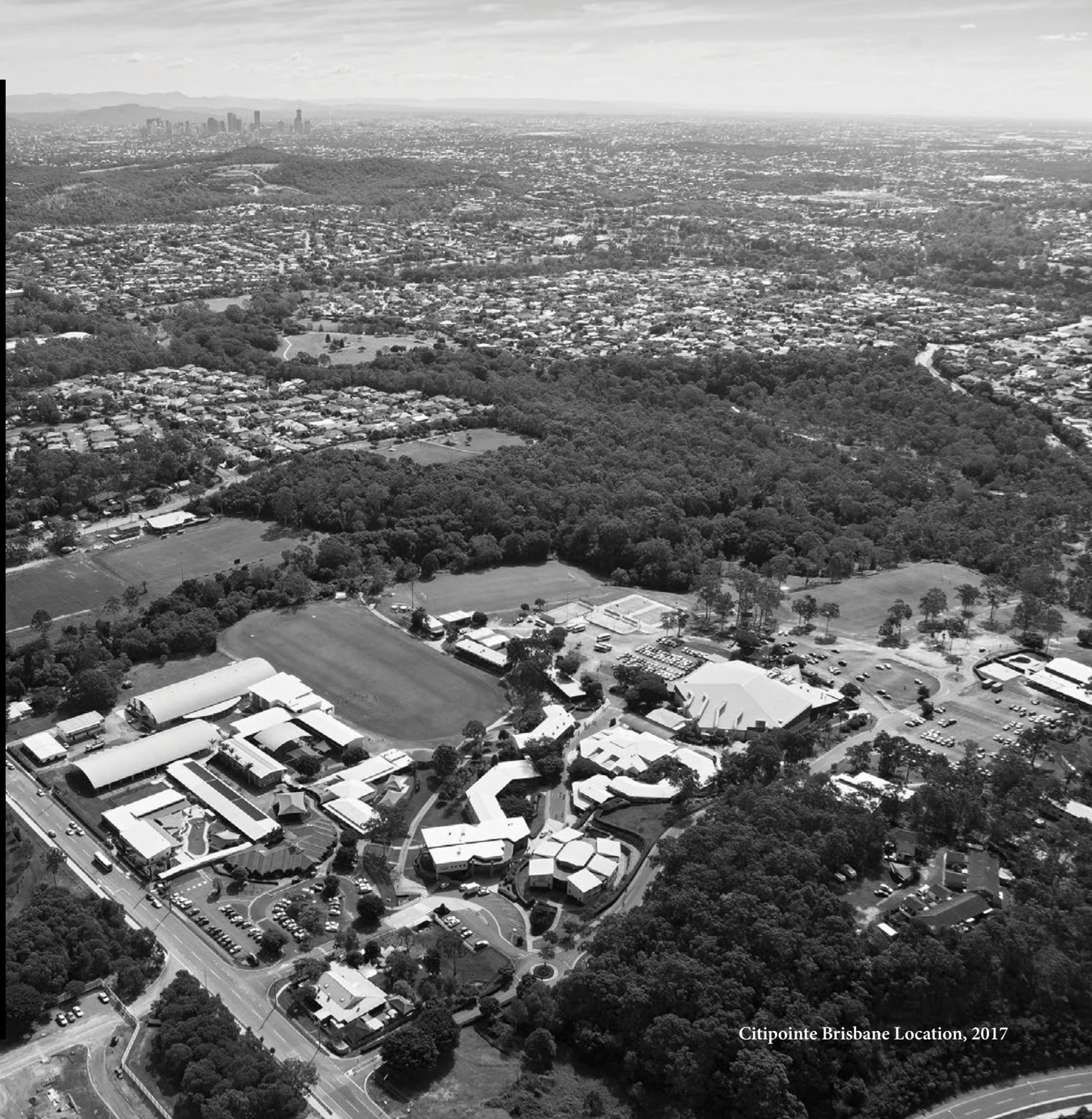
Citipointe Brisbane Location, 2017

Citipointe Church is now one of Australia's largest and most influential churches with the mission to "Unmistakably Influence our World for Good and for God" .