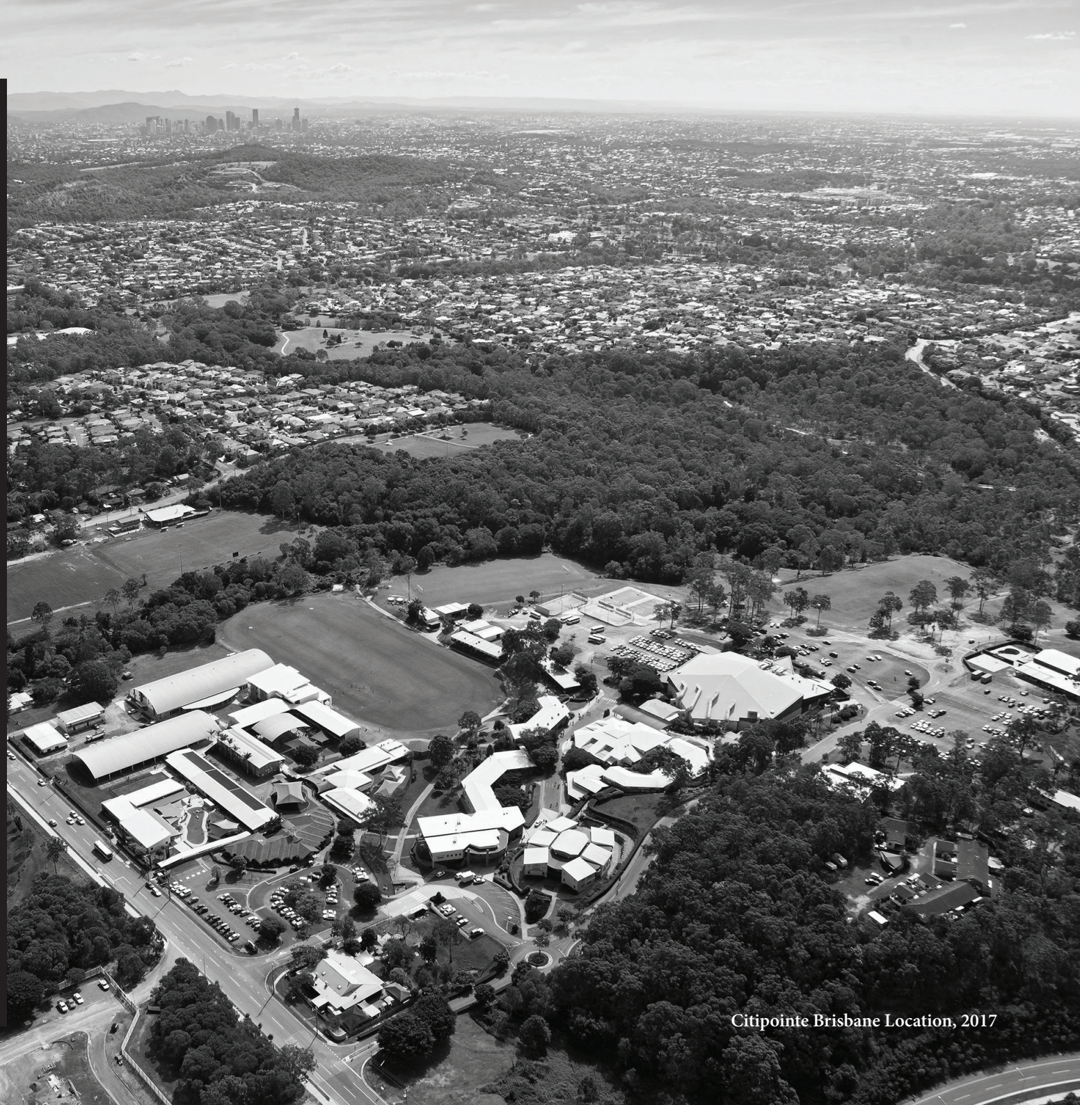
Citipointe Brisbane Location, 2017

Citipointe Church is now one of Australia's largest and most influential churches with the mission to "Unmistakably Influence our World for Good and for God" .